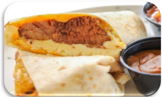
Pot Roast Wrap

Warm Meltaway Pot Roast • Warm Mashed Potatoes Gravy & Tortilla Wrapped.