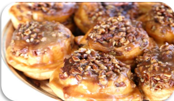
Big Caramel Pecan Rolls