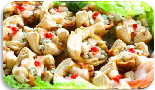
Shrimp Puff Purses

Baby Shrimps & Bleu & Jack Cheese in Hot Flakey Pastry "Puffed" & Served Warm.