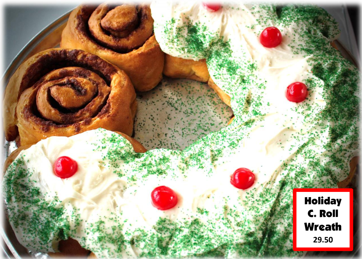
Holiday C. Roll Wreath 29.50