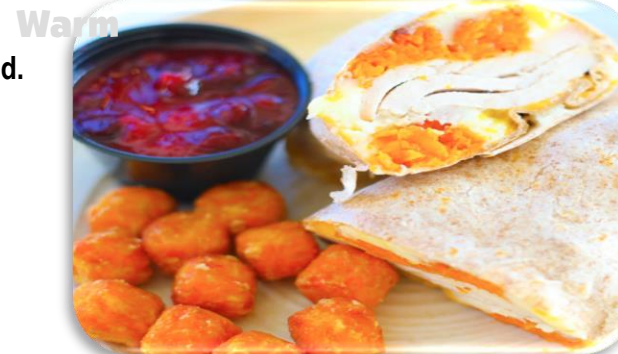
Hot Turkey Wrap

Warm HoneyFried Chicken Slices • Warm Mashed Potatoes Cheese Mix • Green Onions • Ranch Drizzle & Tortilla Wrapped.