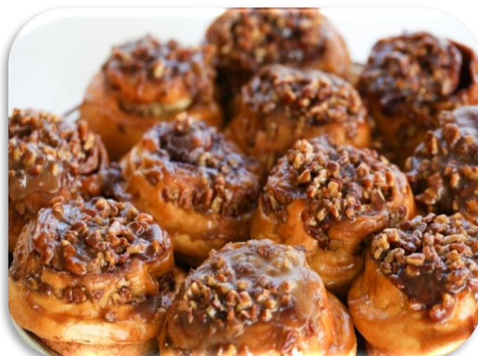
Large Caramel Pecan Sticky Rolls