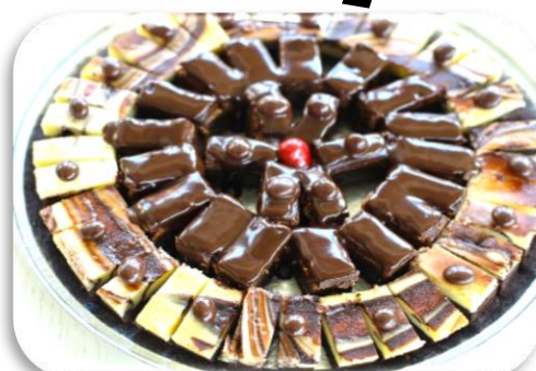
Cocktail Brownie Tray

Perfect Little Chocolatey Sweet Brownies. Fresh Baked & Perfectly Petite.