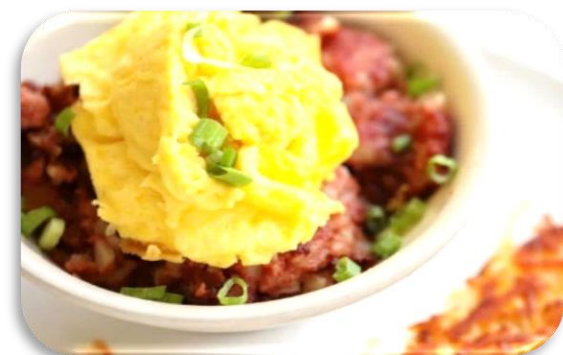
Corned Beef Casserole