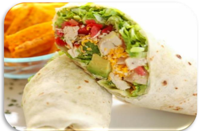
Mother Earth Veggie Wrap

Herbed Cream Cheese • Lettuce • Tomatoes • Peppers Onions • Roasted Red Peppers • Cucumber • Ranch Drizzle & Tortilla Wrapped.