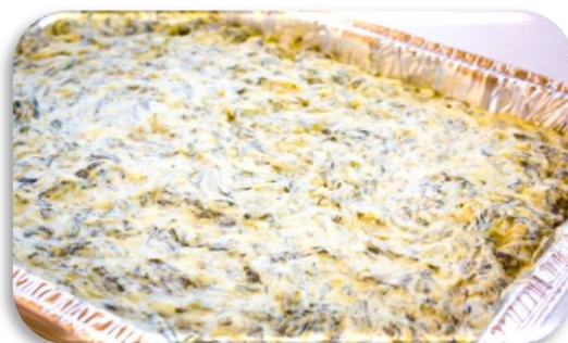
Spinach Artichoke Dip