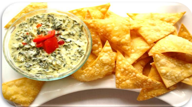
Spinach & Artichoke Dip with Chips

A 6X13 Pan of Spinach Artichoke Dip & One Very Deep Pan of Chips • $49 ● Add a Very Deep Dish Pan of Chips • $15