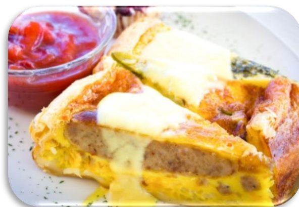
Quiche of the Month

Big Warm Flour Tortillas Wrapped with Potatoes & Eggs & Bacon & Sausage. "Grande Sized" Half Wraps Served Warm.