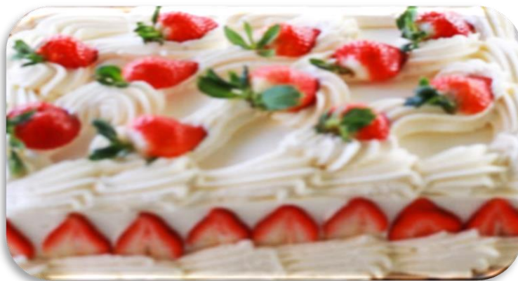
StrawBerry Wedding Cake

Available by PreOrder. $15 Per Plate of Cake Samples.