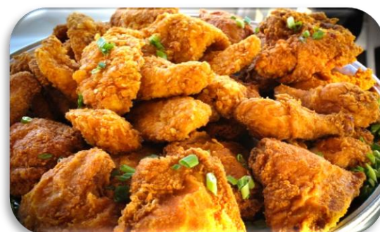
HoneyFried Chicken DrumSticks