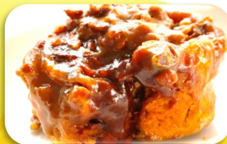
GF Pecan Roll