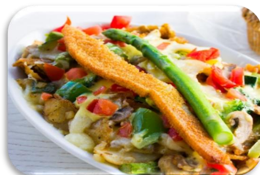
Garden City Casserole