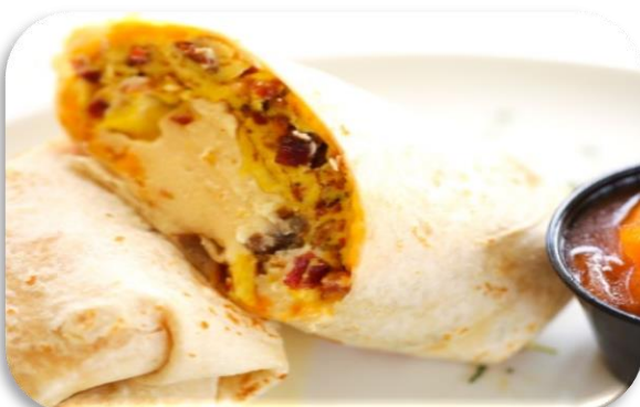
Ron's AM Wrap

Flakey Puff Pastry Golden Baked with Bacon & Eggs & Cheese & Hollandaise.