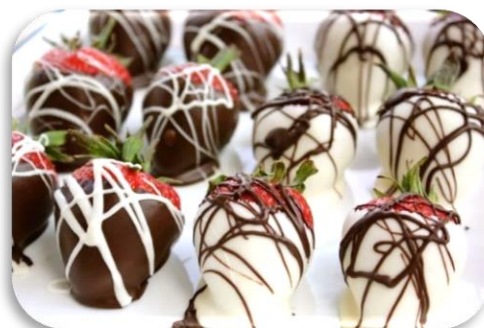
Choco Dip Strawberries