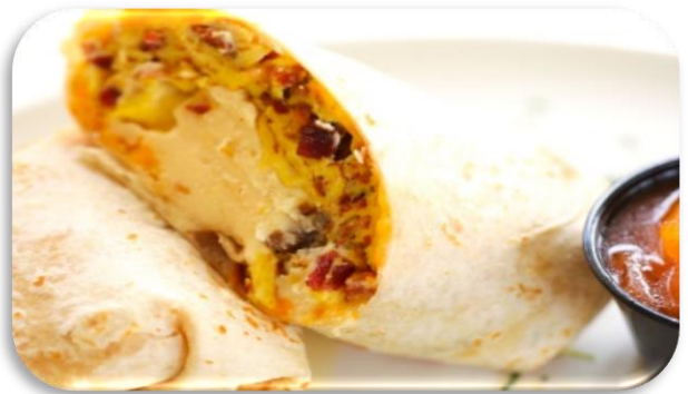
Ron's AM Wrap