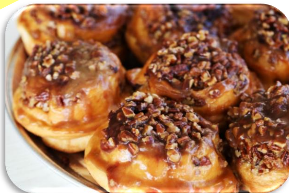
Pecan Sticky Rolls