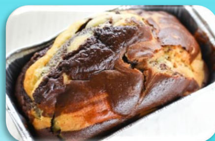
GF Marble Bread