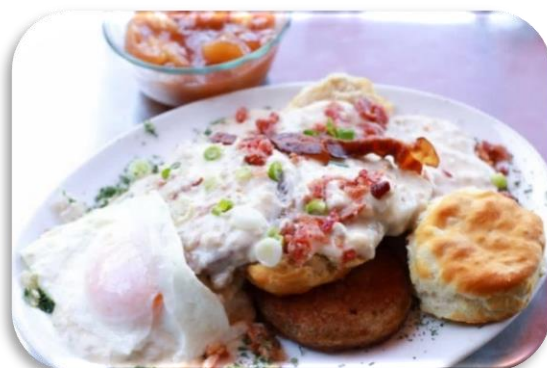
Biscuits & Gravy