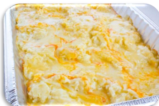
Cheesy Crème Brule Potatoes