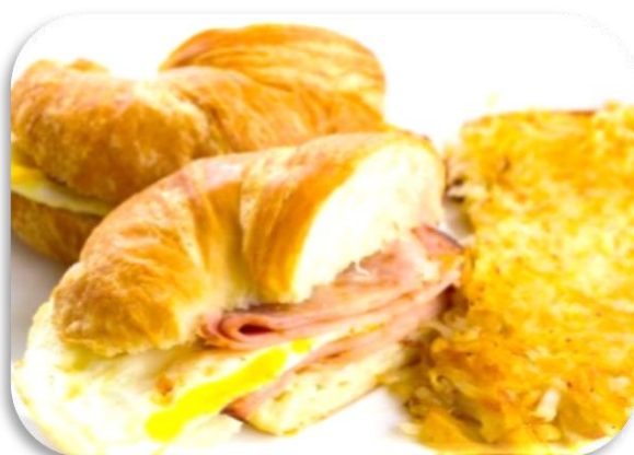
Croissant Breakfast Sand

Flakey Southern Biscuits Stacked with Egg & Canadian Bacon & a Mayo Spread with American Cheese & Served Warm.