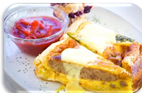
Quiche of the Month