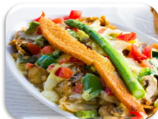
Garden City Casserole