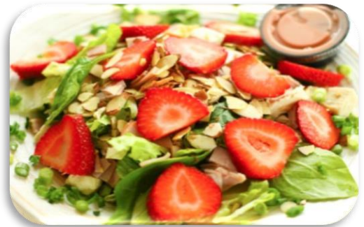
Ritz Hotel Salad

A Mix of Greens with Chunks of CharGrilled Chicken Breast & French Canadian Bacon & Fresh Sliced Strawberries with Toasted Almonds Tossed in Our Strawberry Rhubarb Vinaigrette Dressing.