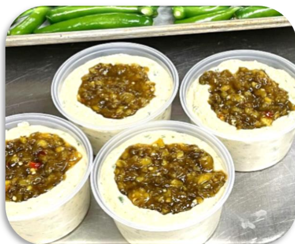
Jalapeno Hummus with Chips

A 6X13 Pan of Jalapeno Hummus Garnished with One Very Deep Dish Pan of Chips • $49 ● Add on a Deep Dish Pan of Chips • $15