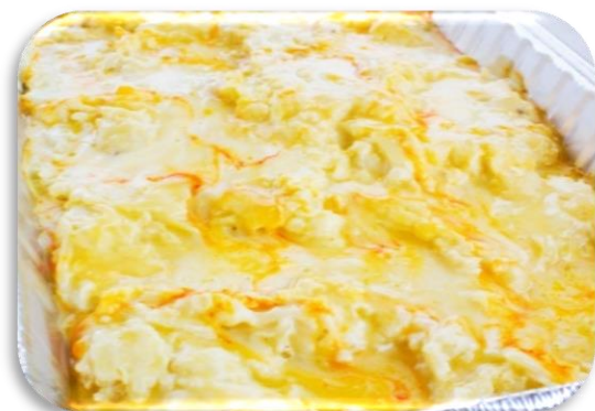
Crème Brule Potatoes