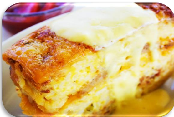
Baked Egg Stratta $59