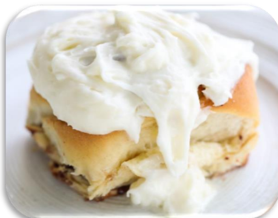
Ron's Cinnamon Roll