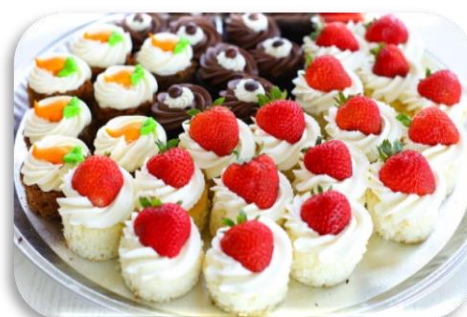
Cake Sampler T ray