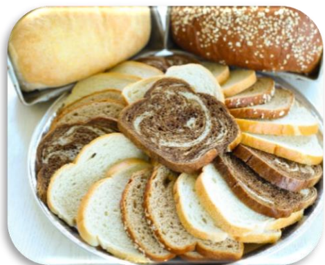
Fresh Baked Bread Slices