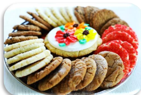
Mini Cookie Tray