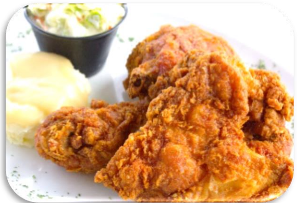
Ron's Honey Fried Chicken