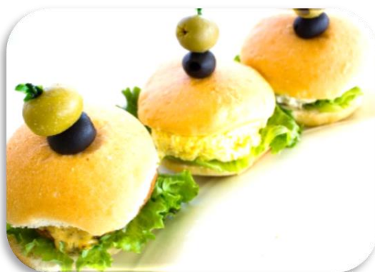
Butter Bun Sands

Our Soft ButterBuns Stuffed with Your Choice of Any Fresh Roasted Meats & Cheeses or Salads.