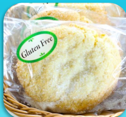
GF Sugar Cookies