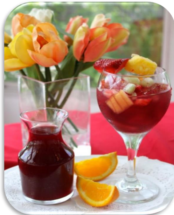
Andrés House Sangria

Coffee Condiments for 10 = $7.5 (20 Creamers/30 Sugar Mix)