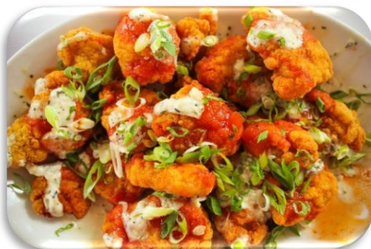
Wings on Fire

Presented with Your Choice of Sauces. Ranch or HoneyMustard or BBQ or Fire.