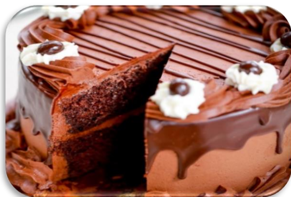
Mom's Chocolate Cake