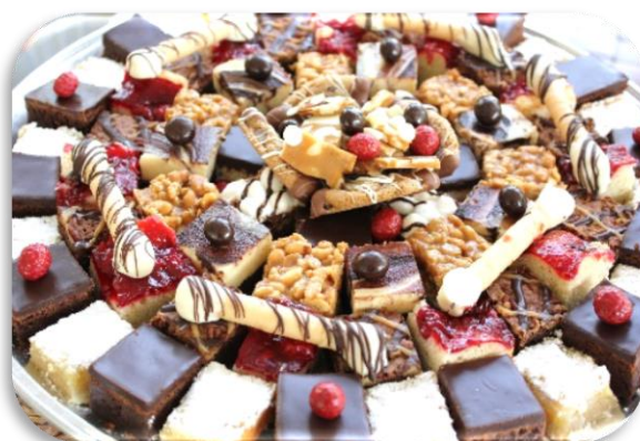
Sweet Temptation Trays