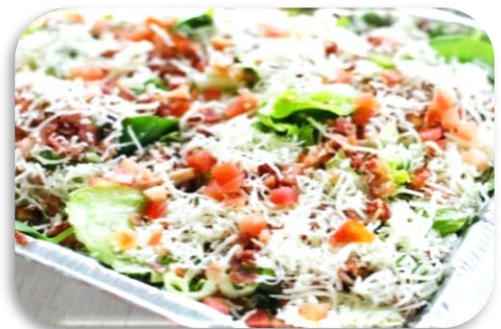
Swiss Hotel Salad

A Fresh Mix of Greens Topped with Rows of Bacon Bits & Cooked Egg Slices & Avocado & Green Onions & Tomatoes & Cheddar Cheddar Cheese & Chicken & Crumbled Bleu Cheese. Served with Our PepperCorn Dressing.