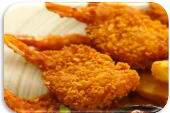
Big Crispy Shrimp

Large Crispy Golden Shrimp Choose Spicy Cocktail or Mango Salsa.