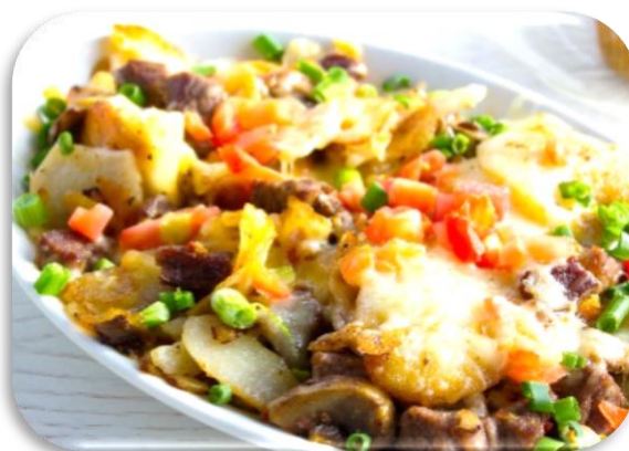
Veggie Medallion Casserole

•Add a Layer of Scrambled Eggs is Optional – No Charge