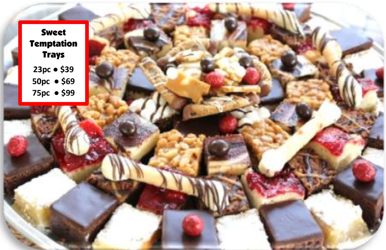
Sweet Temptation Trays 23pc • $39 50pc • $69 75pc • $99