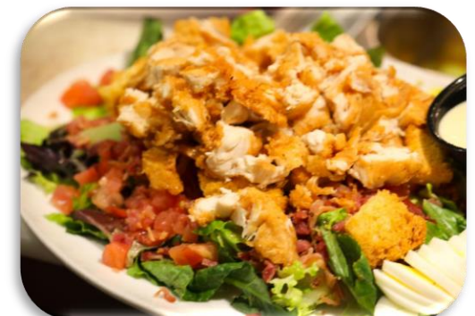
Grams Chicken Salad 7

"Our House Signature Salad" Kitchen Tossed "Spring Greens" & Fresh Grated Gruyere & Toasted Nuts & Bacon Tossed in Our House Creamy Herb Dressing & Topped with Diced Tomatoes.