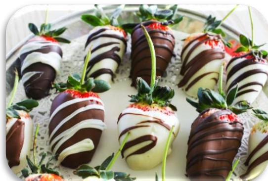
Choco Dipped Strawberries