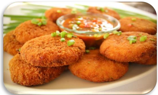
Crispy Crab Cakes

Warm Crispy Golden Crab Cakes with Mango Salsa or Lemony Hollandaise.