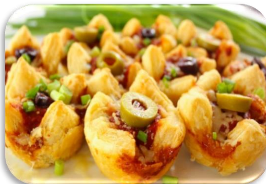
Olive Cheese Puff Purses

Minced Kalamata & Green Olives & Jack Cheese & Marinara "PUFFED" en Pastry.