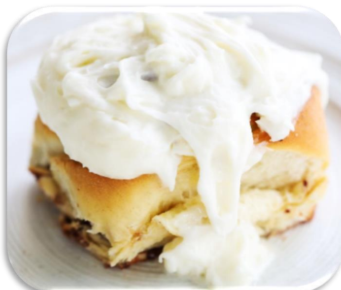
Ron's Big White Iced Cinnamon Roll