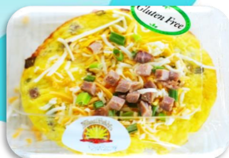
GF Quiche Lorraine