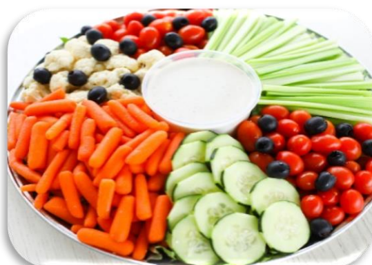
Fresh Veggie Tray