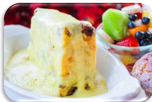
Baked Egg Stratta

A Very Deep Dish Baked Egg Specialty at WheatFields. Layers & Layers of Ingredients with Sausage & Bacon & Potatoes & Cheese & Eggs. ***Includes a Pint of Hollandaise.