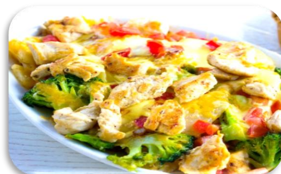
Black Forest Casserole