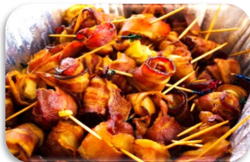
Bacon Wrapped Chestnuts

Traditional Crispy Bacon Wrapped Chestnuts. Served Warm.