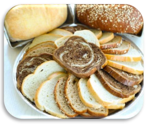
Fresh Baked Bread Slices