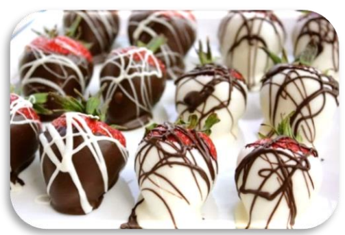
Choco Dip Strawberries