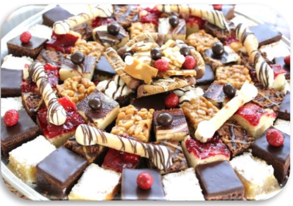
Sweet Temptation Trays