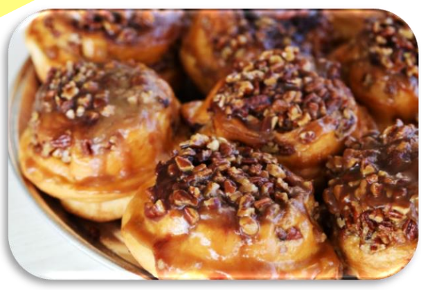
Pecan Sticky Rolls

12 Mini Cinnamon Rolls19.99 panRasperry Croissants3.09eaCinnamon or Caramel Roll5.99 eaPecan Roll5.99 ea