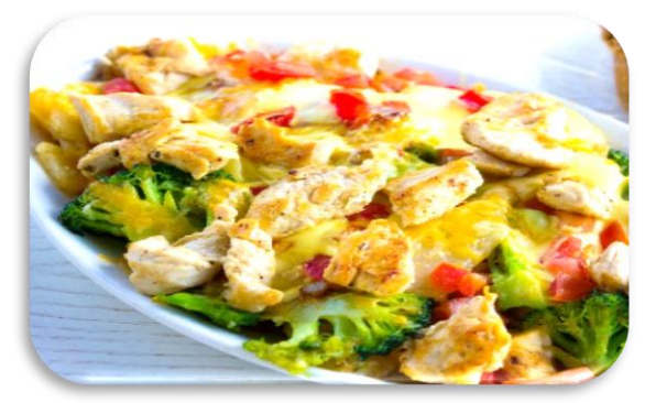
Black Forest Casserole