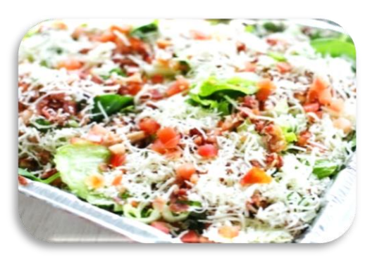
Swiss Hotel Salad