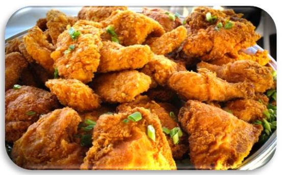
HoneyFried Chicken DrumSticks