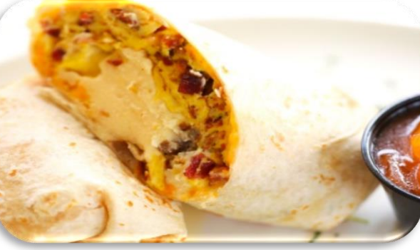
Ron's AM Wrap

Herbed Cream Cheese • Lettuce • Tomatoes • Peppers Onions • Roasted Red Peppers • Cucumber • Ranch Drizzle & Tortilla Wrapped.