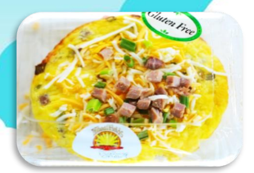
GF Quiche Lorraine