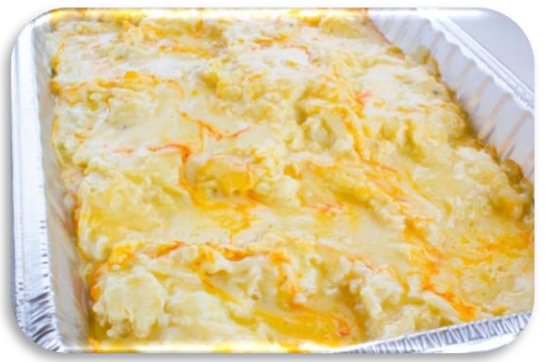
Cheesy Crème Brule Potatoes