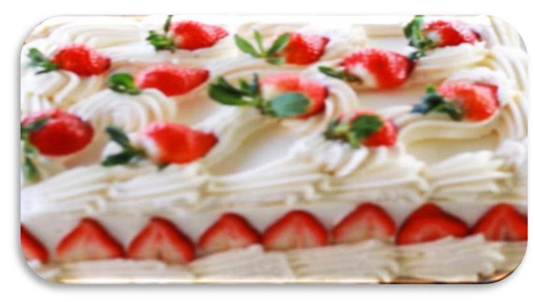
StrawBerry Wedding Cake