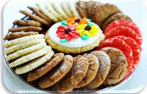
Mini Cookie Tray