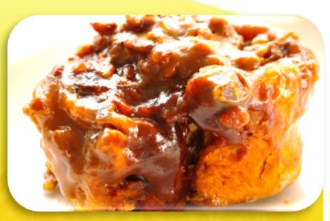
GF Pecan Roll