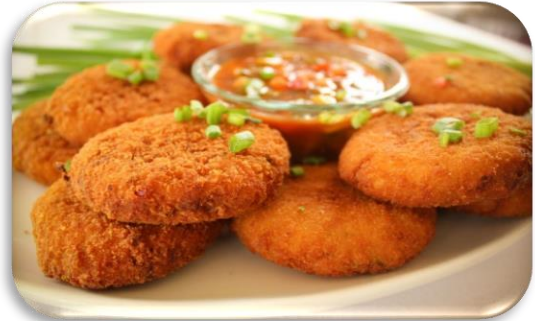
Crispy Crab Cakes