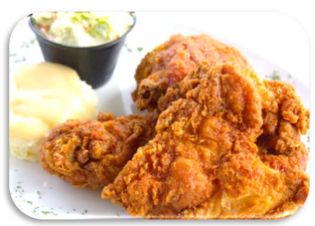
Ron's Honey Fried Chicken