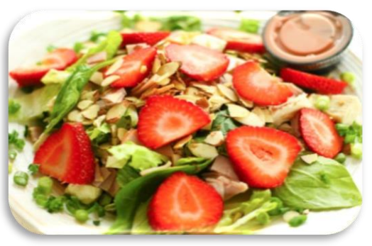
Ritz Hotel Salad

6x13 Serves about 3 Entrée Salads 9x13 Serves About 6 Entrée Salads 9x13 Serves 10+ Salad Sides