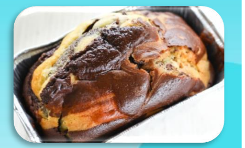
GF Marble Bread