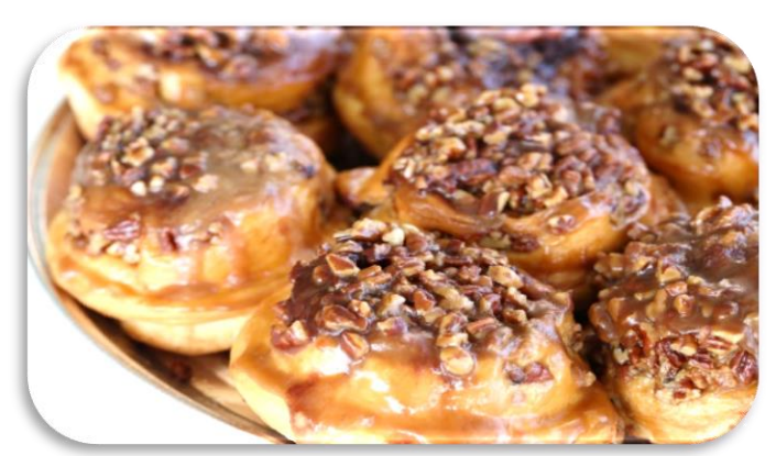
Big Caramel Pecan Rolls