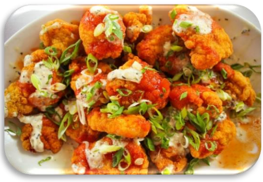
Wings on Fire