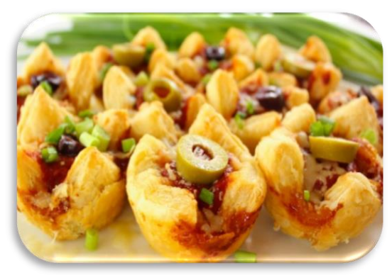
Olive Cheese Puff Purses