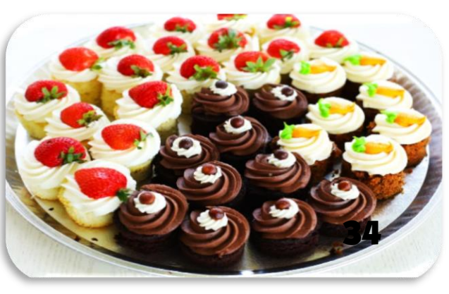
Gourmet Cake Sampler Trio