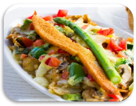
Garden City Casserole