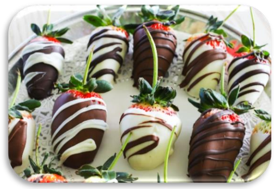
Choco Dipped Strawberries