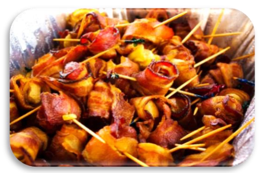
Bacon Wrapped Chestnuts

30 pc Pan • 39.99 Crispy Golden Cheese Sticks Presented with Marinara.