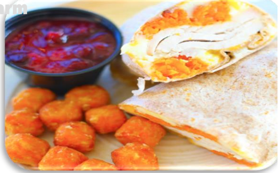
Hot Turkey Wrap