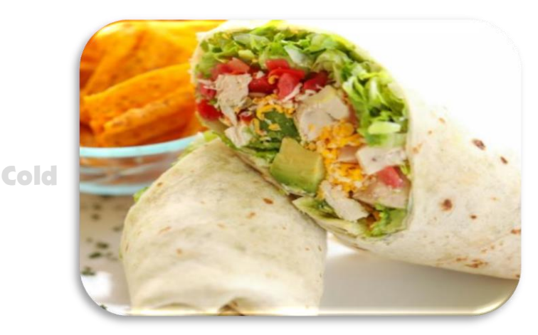
Mother Earth Veggie Wrap