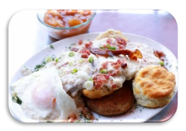
Biscuits & Gravy