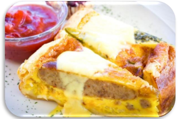
Quiche of the Month