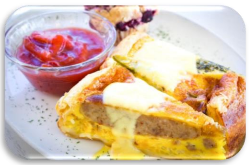
Quiche of the Month