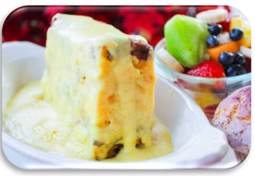
Baked Egg Stratta