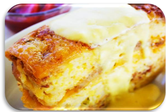
Baked Egg Stratta 59.99