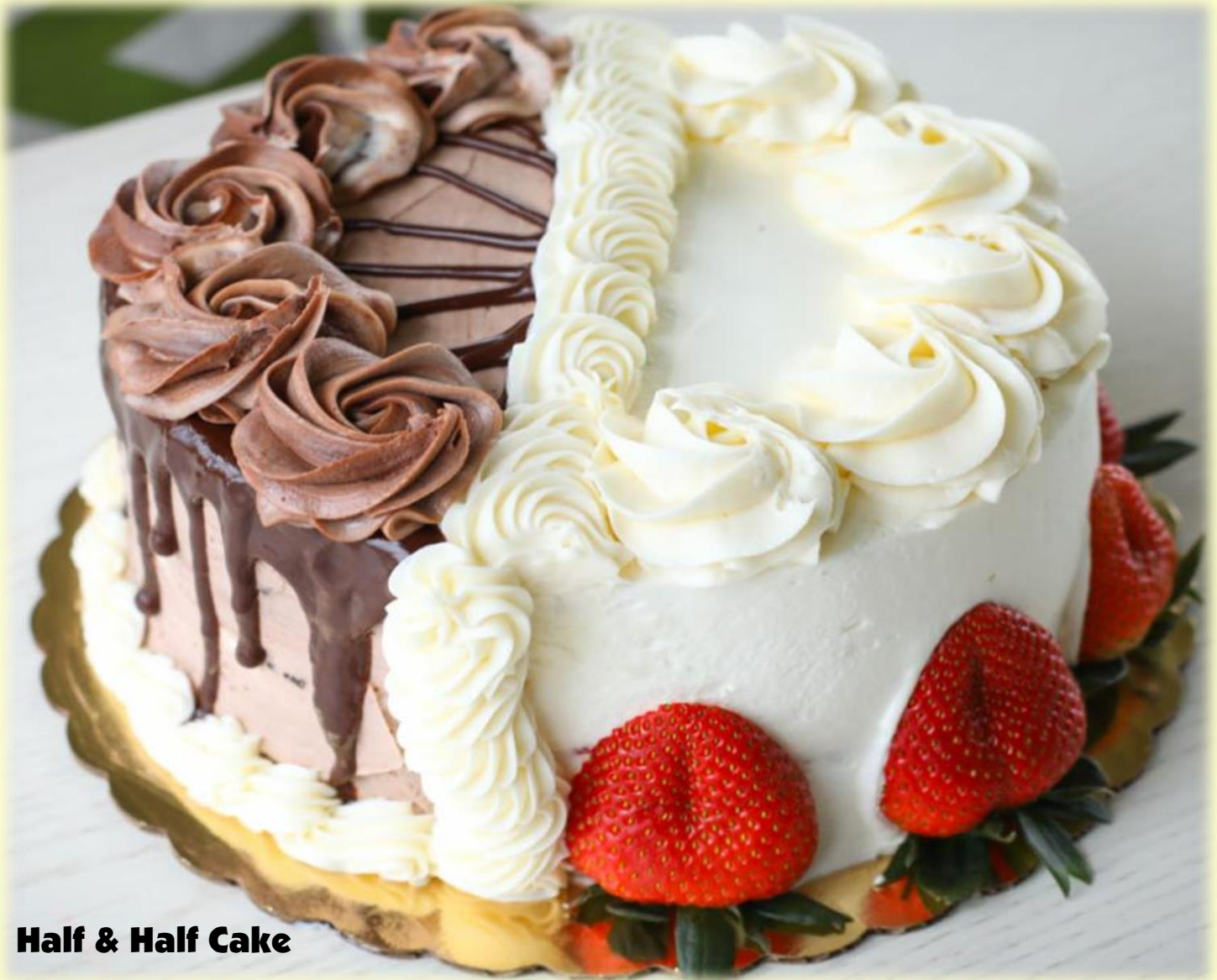
Half & Half Cake

402•955•1485 www.wheatfieldscatering.com