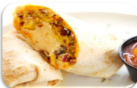
Ron's AM Wrap

Our Flakey Half Croissants Brimming with Eggs & Bacon & Cheese & a Mayo Spread.