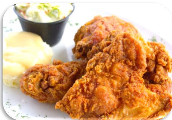
Ron's Honey Fried Chicken