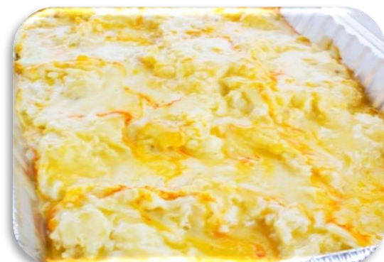
Crème Brule Potatoes