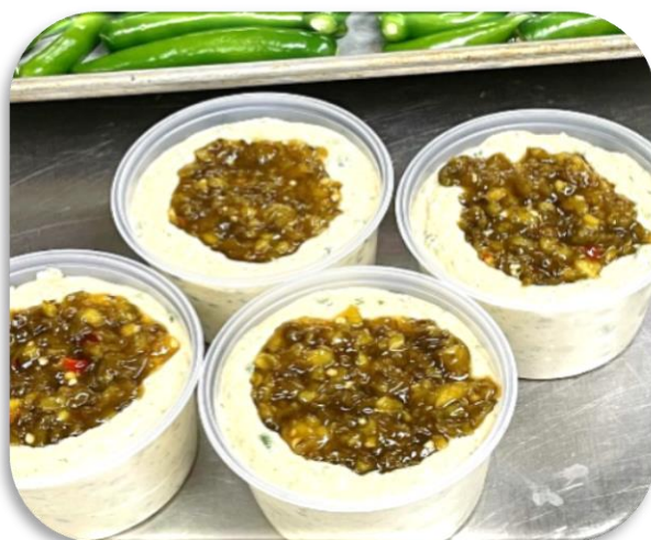
Jalapeno Hummus with Chips

A 6X13 Pan of Jalapeno Hummus Garnished with One Very Deep Dish Pan of Chips • 59.99 ●Add on a Deep Dish Pan of Chips • 19.99