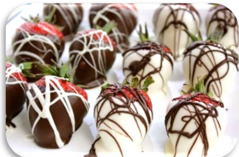
Choco Dip Strawberries