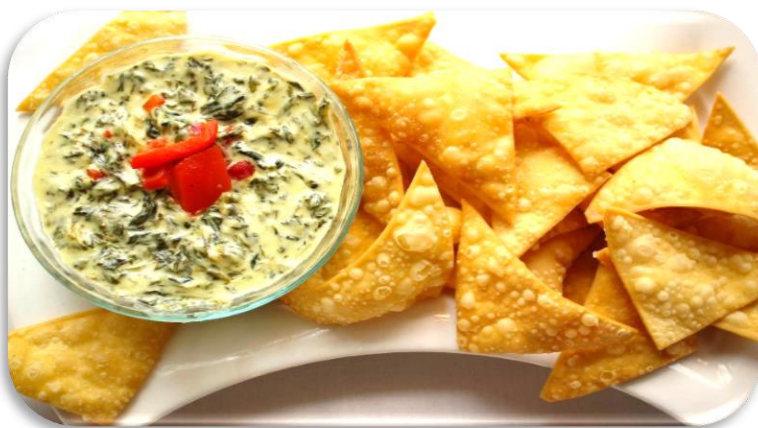
Spinach & Artichoke Dip with Chips

A 6X13 Pan of Spinach Artichoke Dip & One Very Deep Pan of Chips • 59.99 ●Add a Very Deep Dish Pan of Chips • 19.99