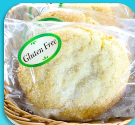
GF Sugar Cookies