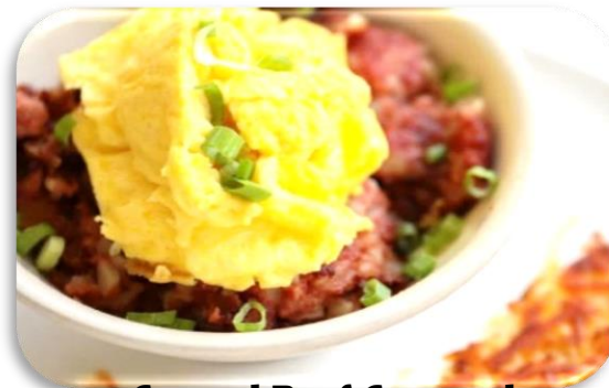
Corned Beef Casserole