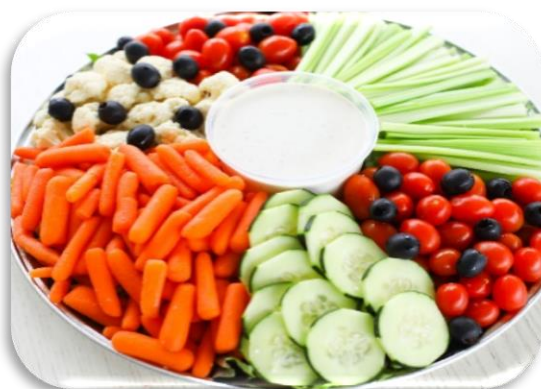
Fresh Veggie Tray