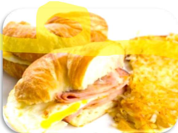
Croissant Breakfast Sand