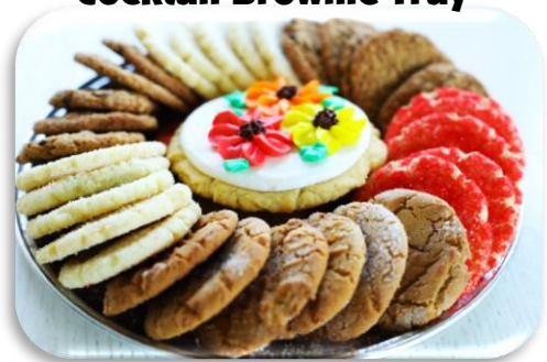
Mini Cookie Tray