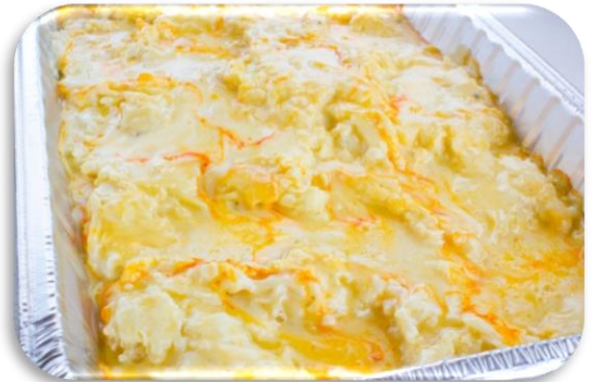
Cheesy Crème Brule Potatoes