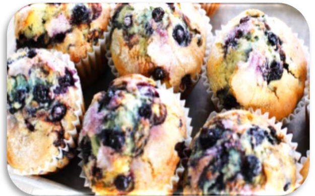
Grandé BlueBerry Muffins