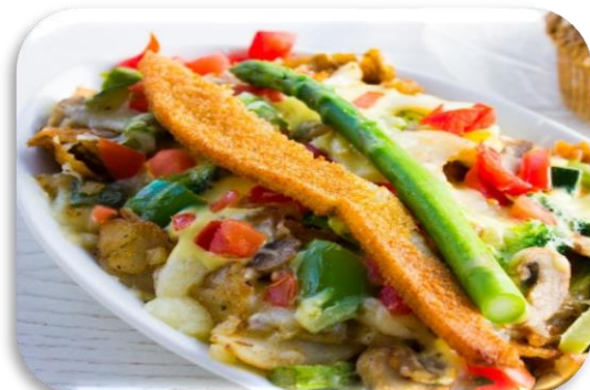
Garden City Casserole