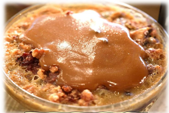
Caramel Bread Pudding 6x13 Pan 29.99 9x13 Pan 39.99