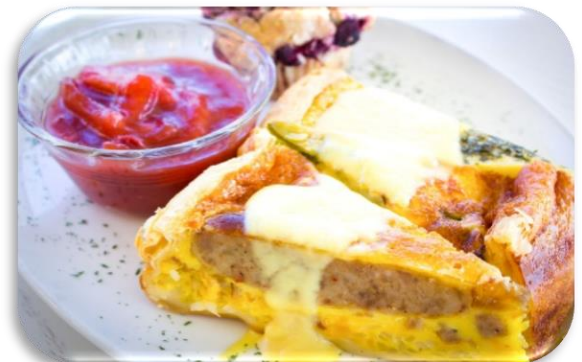
Quiche of the Month