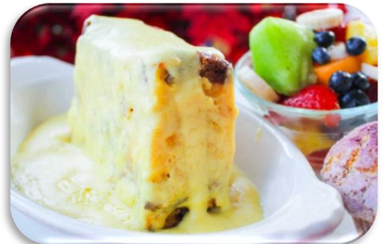
Baked Egg Stratta

A Very Deep Dish Baked Egg Specialty at WheatFields. Layers & Layers of Ingredients with Sausage & Bacon & Potatoes & Cheese & Eggs. ***Includes a Pint of Hollandaise.