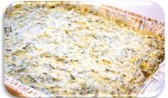
Spinach Artichoke Dip