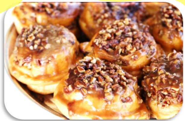
Pecan Sticky Rolls