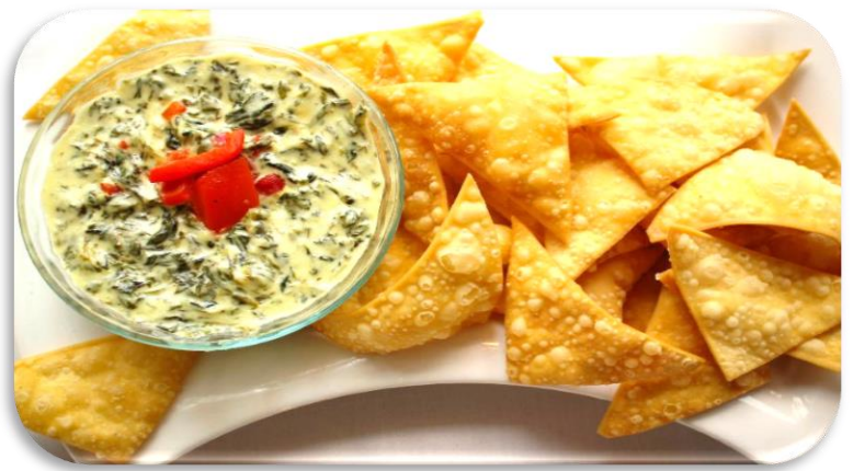
Spinach & Artichoke Dip with Chips

•Add a Very Deep Dish Pan of Chips • 15.99