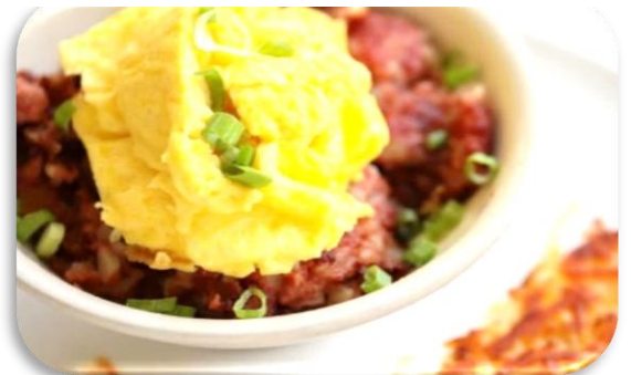
Corned Beef Casserole