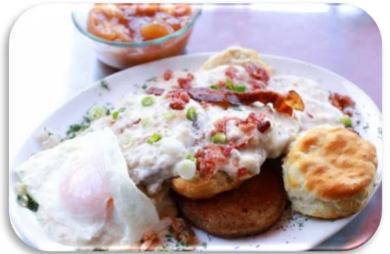
Biscuits & Gravy