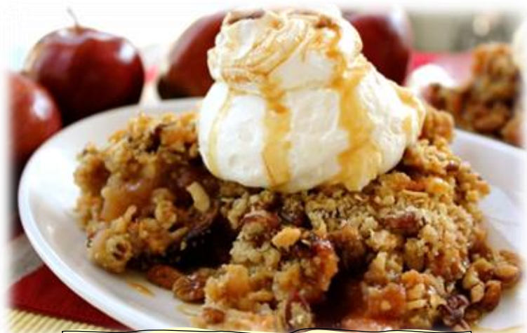
Caramel Apple Pecan Crisp 6X13 Pan 29.99 9x13 Pan 39.99