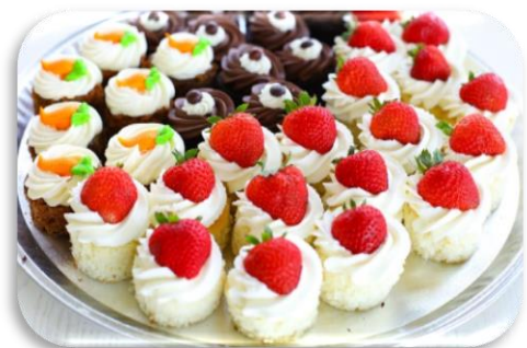
Cake Sampler T ray

Usually Zebra Brownies-Lemon Bars-Caramel Oat-Kate Hepburn Brownies-Nutella Bars-Turtle Fudge Brownies