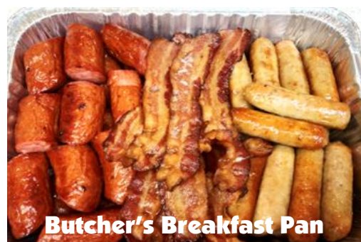
Butcher's Breakfast Pan

60 pcs Breakfast Meats-All in One Pan • 99.99