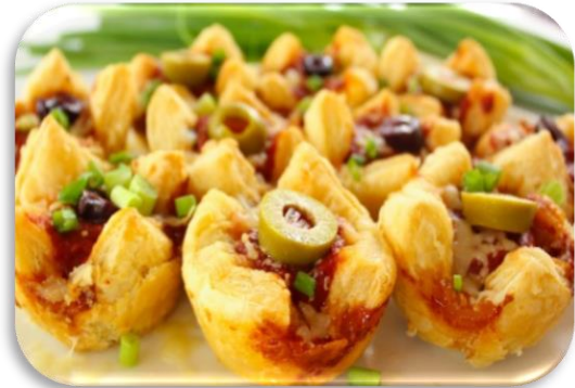
Olive Cheese Puff Purses

Minced Kalamata & Green Olives & Jack Cheese & Marinara "PUFFED" en Pastry.