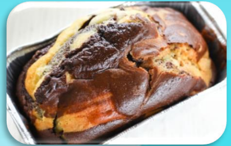
GF Marble Bread