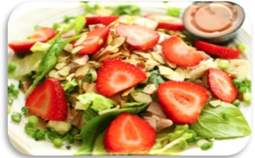
Ritz Hotel Salad

A Mix of Greens with Chunks of CharGrilled Chicken Breast & French Canadian Bacon & Fresh Sliced Strawberries with Toasted Almonds Tossed in Our Strawberry Rhubarb Vinaigrette Dressing.