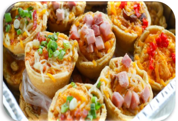
Mini Quiche Mix

Big Warm Flour Tortillas Wrapped with Potatoes & Eggs & Bacon & Sausage. "Grande Sized" Half Wraps Served Warm.