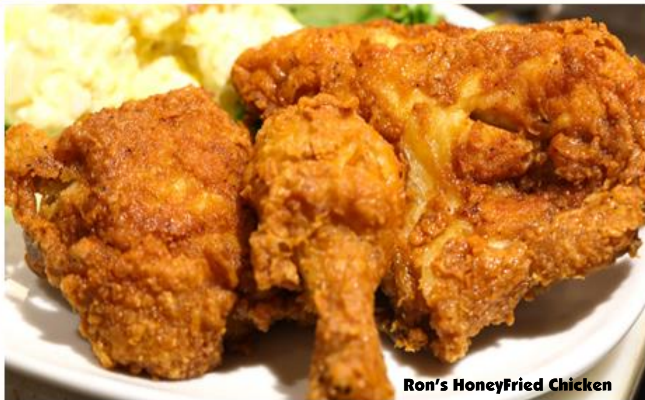
Ron's Honey Fried Chicken

Includes One Quart of Potato Salad & One Pasta Salad & ButterBuns 39.99