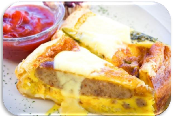
Quiche of the Month

Flakey Puff Pastry Golden Baked with Bacon & Eggs & Cheese & Hollandaise.