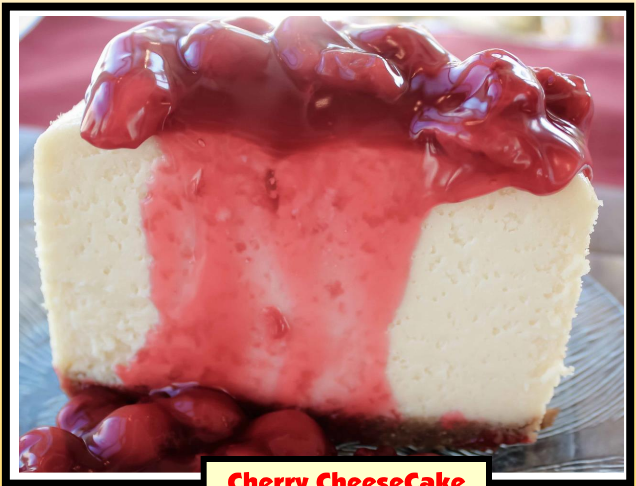
Cherry CheeseCake By the Inch