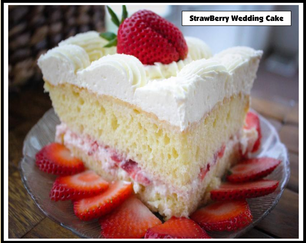
StrawBerry Wedding Cake