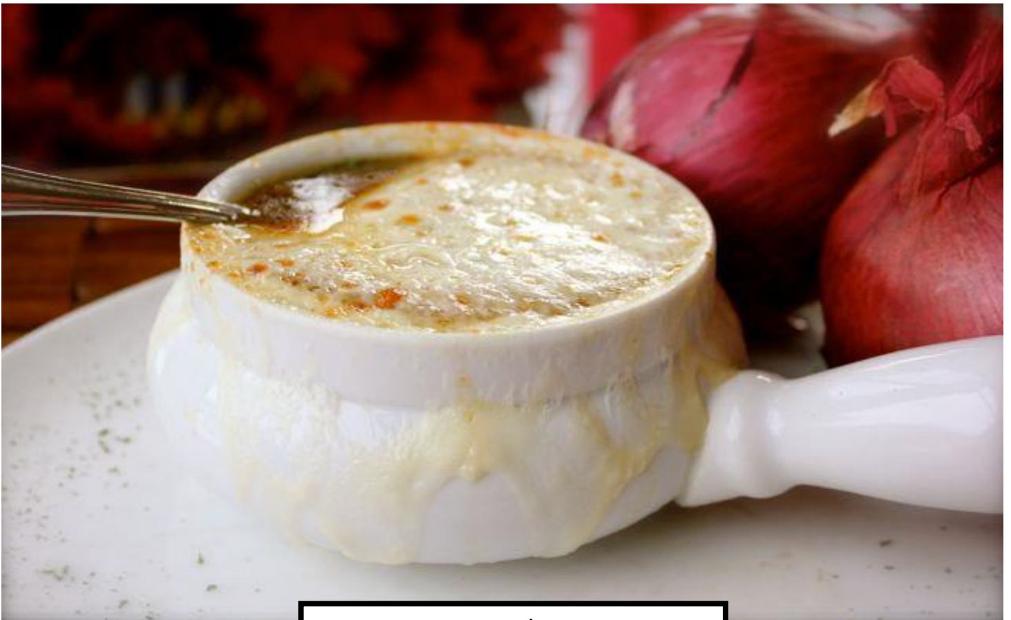
French Onion Soup