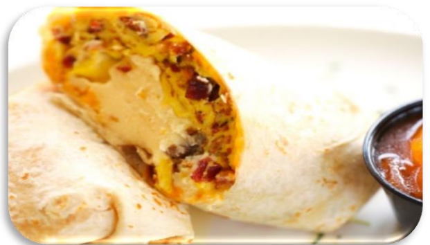
Ron's AM Wrap

Herbed Cream Cheese • Lettuce • Tomatoes • Peppers Onions • Roasted Red Peppers • Cucumber • Crispy Golden Egg Plant • Ranch Drizzle & Tortilla Wrapped.