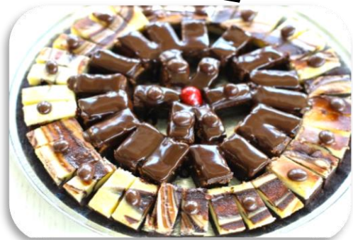
Cocktail Brownie Tray

Perfect Little Chocolatey Sweet Brownies. Fresh Baked & Perfectly Petite.