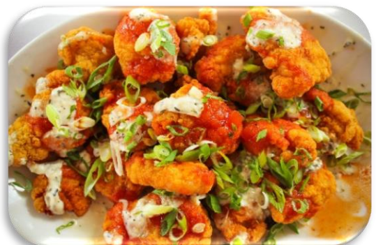
Wings on Fire

Presented with Your Choice of Sauces. Ranch or HoneyMustard or BBQ or Fire.