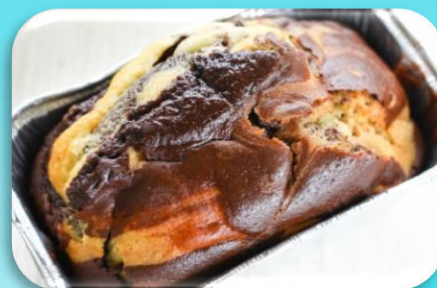
GF Marble Bread