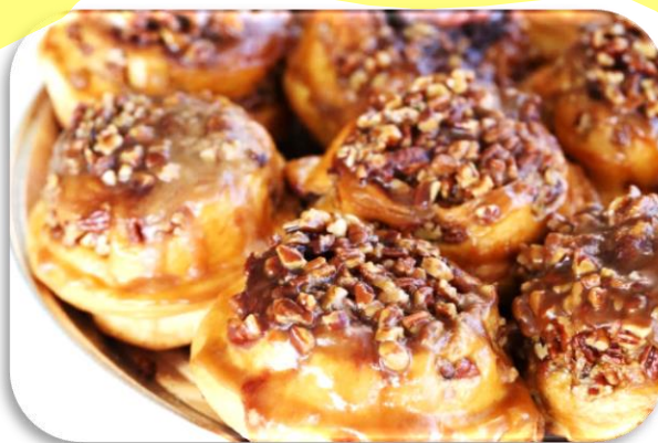
Pecan Sticky Rolls