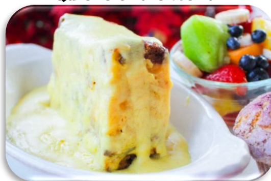
Baked Egg Stratta

A Very Deep Dish Baked Egg Specialty at WheatFields. Layers & Layers of Ingredients with Sausage & Bacon & Potatoes & Cheese & Eggs. ***Includes a Pint of Hollandaise.