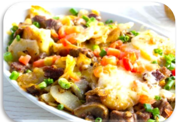
Veggie Medallion Casserole

Potatoes Ala Creme Flamed with Muenster Cheese & Smokey Ham Slices.