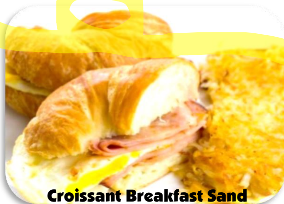
Croissant Breakfast Sand