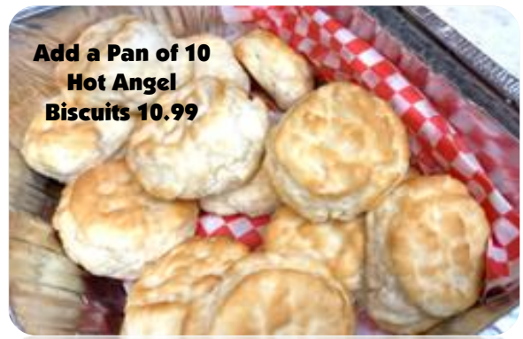
Add a Pan of 10 Hot Angel Biscuits 10.99