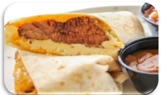
Pot Roast Wrap