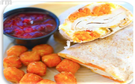
Hot Turkey Wrap