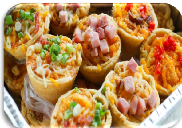
Mini Quiche Mix

•6 Ham & Cheese •6 Veggie Cheese •6 Chicken Broccoli Almond •6 Bacon & Cheese