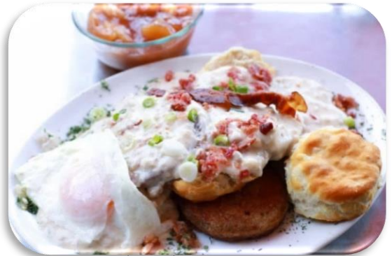
Biscuits & Gravy