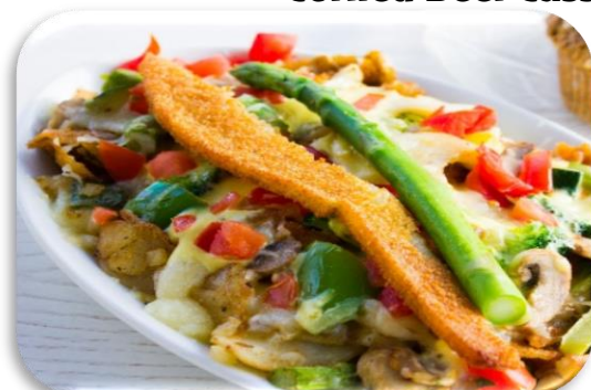
Garden City Casserole