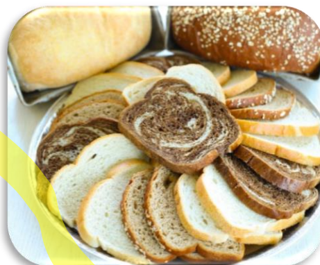
Fresh Baked Bread Slices