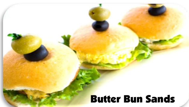
Butter Bun Sands

Mini Flaky Croissants Filled with a Trio of Salads: Egg Salad – Chicken Salad – Apricot Chicken Salad – Albacore Tuna Salad.