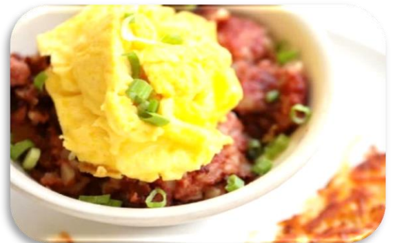
Corned Beef Casserole