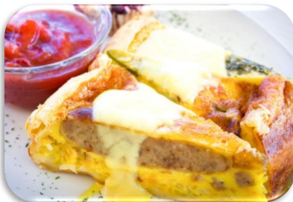
Quiche of the Month

Flakey Puff Pastry Golden Baked with Bacon & Eggs & Cheese & Hollandaise.