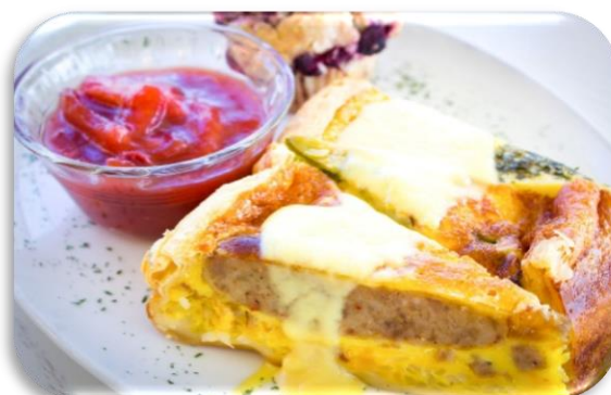
Quiche of the Month