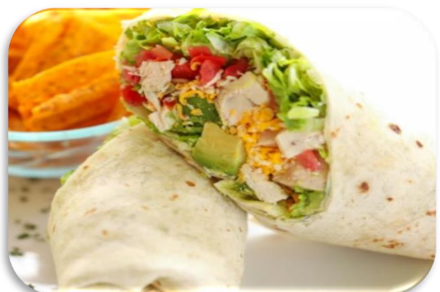
Mother Earth Veggie Wrap