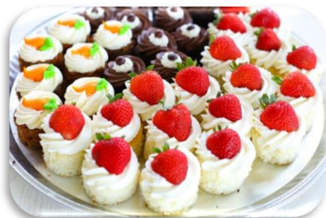
Cake Sampler T ray

Usually Zebra Brownies-Lemon Bars-Caramel Oat-Kate Hepburn Brownies-Nutella Bars-Turtle Fudge Brownies