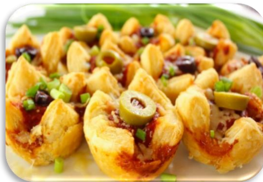
Olive Cheese Puff Purses

Minced Kalamata & Green Olives & Jack Cheese & Marinara "PUFFED" en Pastry.