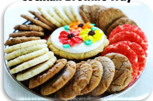
Mini Cookie Tray