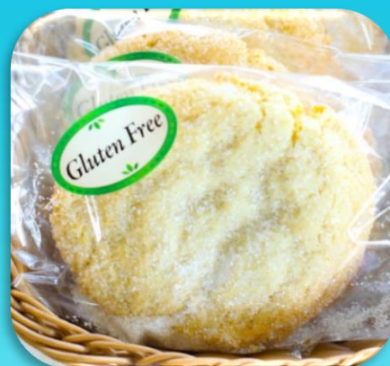
GF Sugar Cookies