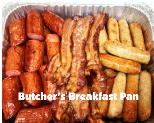
Butcher's Breakfast Pan