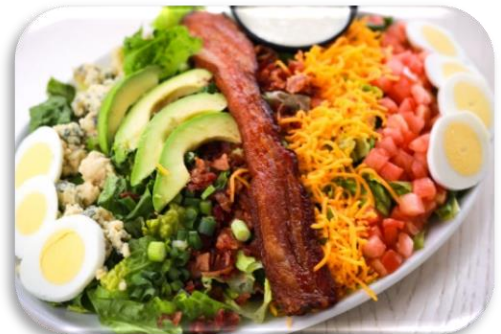
Derby COBB Salad

A Pan of IceBerg Lettuce with a Frame of HomeGrown Tomato Slices & Fresh Shredded Carrots & Cucumber Slices Served with Ranch Dressing. "Fresh & Simple".