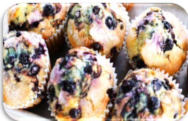
Grandé BlueBerry Muffins