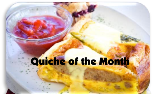
Quiche of the Month