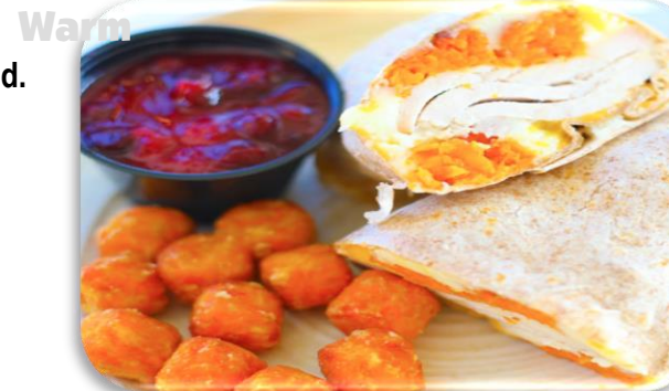
Hot Turkey Wrap

Warm HoneyFried Chicken Slices • Warm Mashed Potatoes Cheese Mix • Green Onions • Ranch Drizzle & Tortilla Wrapped.