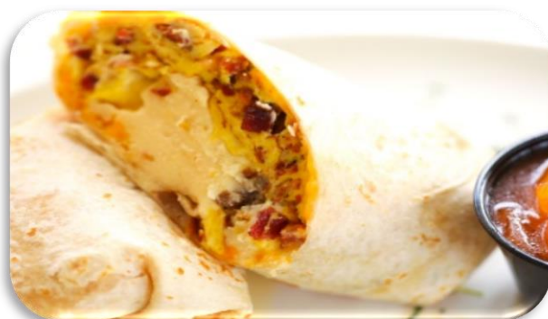
Ron's AM Wrap