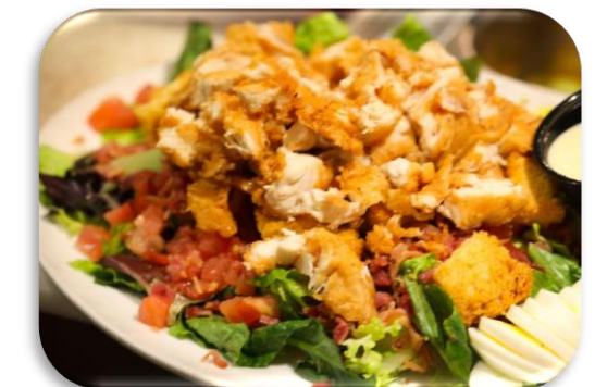
Grams Chicken Salad

"Our House Signature Salad" Kitchen Tossed "Spring Greens" & Fresh Grated Gruyere & Toasted Nuts & Bacon Tossed in Our House Creamy Herb Dressing & Topped with Diced Tomatoes.