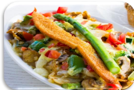
Garden City Casserole