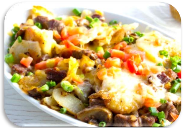
Veggie Medallion Casserole

Potatoes Ala Creme Flamed with Muenster Cheese & Smokey Ham Slices.