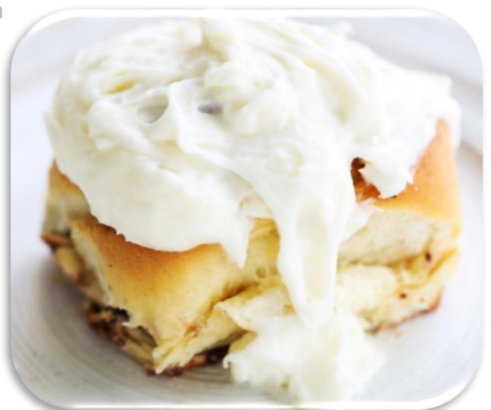
Ron's Big White Iced Cinnamon Roll