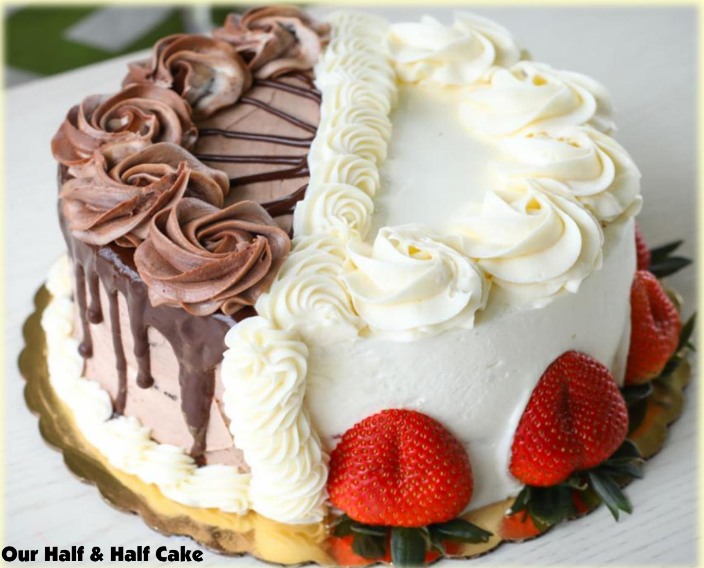
Our Half & Half Cake