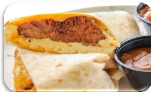
Pot Roast Wrap

Warm Meltaway Pot Roast • Warm Mashed Potatoes Gravy & Tortilla Wrapped.