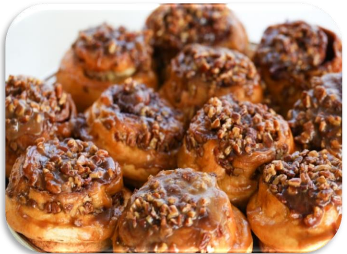
Large Caramel Pecan Sticky Rolls