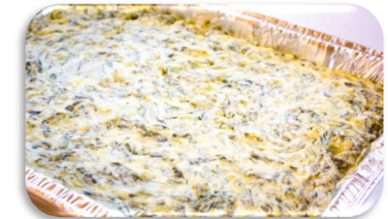
Spinach Artichoke Dip