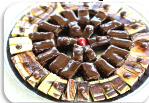
Cocktail Brownie Tray

Perfect Little Chocolate Sweet Brownies. Fresh Baked & Perfectly Petite.