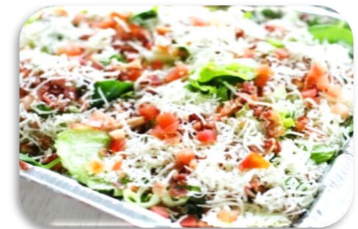
Swiss Hotel Salad

A Fresh Mix of Greens Topped with Rows of Bacon Bits & Cooked Egg Slices & Avocado & Green Onions & Tomatoes & Cheddar Cheddar Cheese & Chicken & Crumbled Bleu Cheese. Served with Our PepperCorn Dressing.