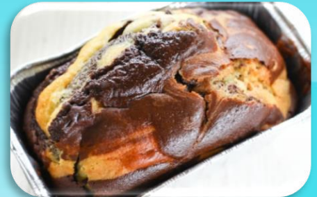
GF Marble Bread