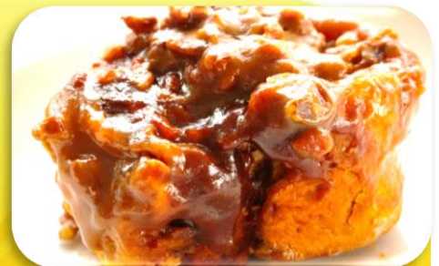
GF Pecan Roll