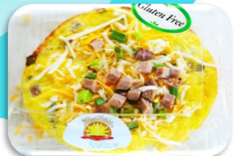
GF Quiche Lorraine