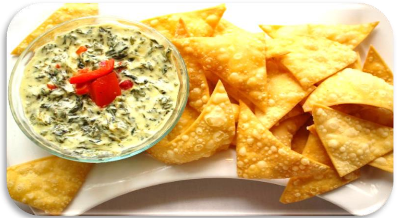
Spinach & Artichoke Dip with Chips