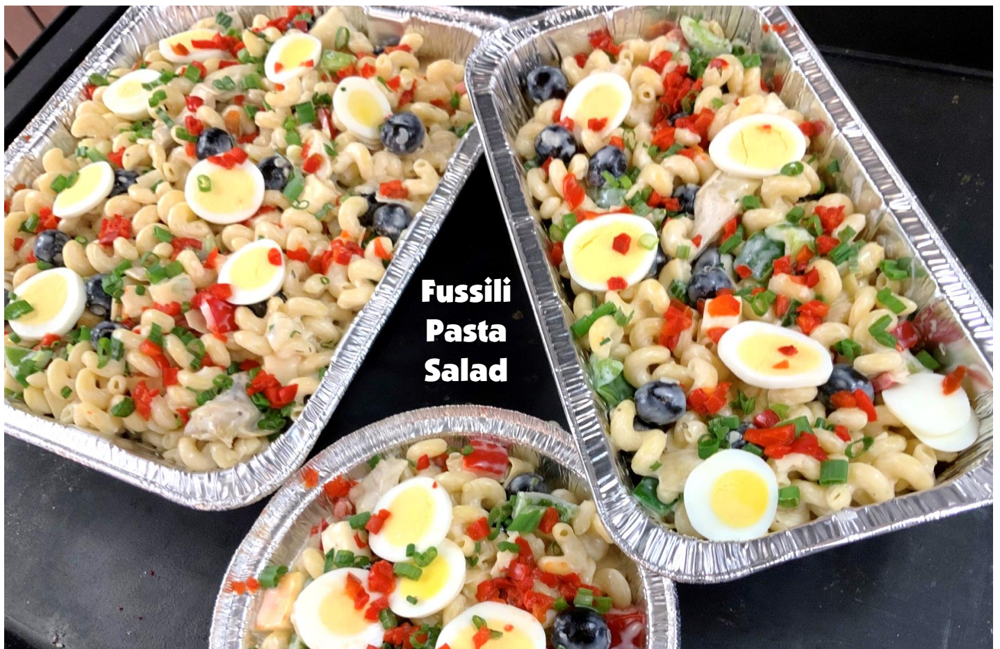
Fussili Pasta Salad