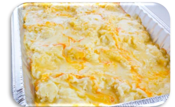
Cheesy Crème Brulee Potatoes