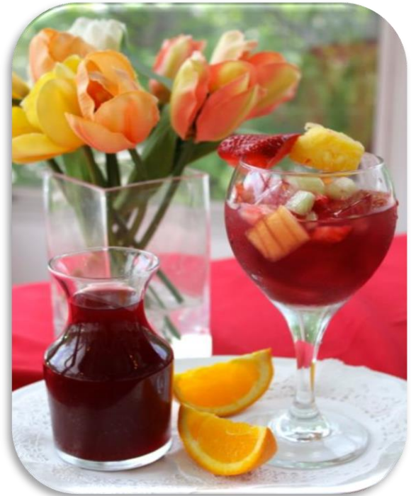
Andrés House Sangria