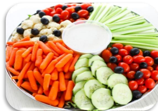
Fresh Veggie Tray