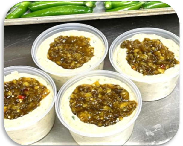
Jalapeno Hummus with Chips