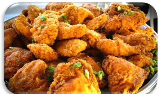
HoneyFried Chicken DrumSticks