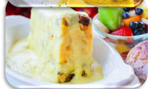
Baked Egg Stratta

A Very Deep Dish Baked Egg Specialty at WheatFields. Layers & Layers of Ingredients with Sausage & Bacon & Potatoes & Cheese & Eggs. ***Includes a Pint of Hollandaise.