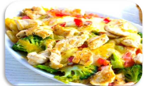
Black Forest Casserole