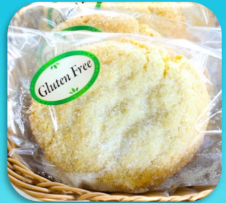
GF Sugar Cookies