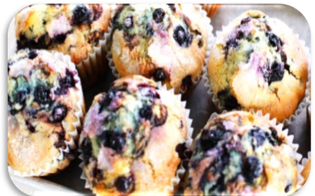
Grandé BlueBerry Muffins