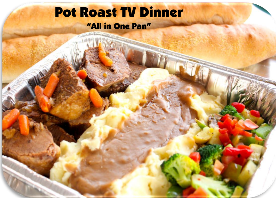
Pot Roast TV Dinner