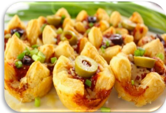
Olive Cheese Puff Purses

Minced Kalamata & Green Olives & Jack Cheese & Marinara "PUFFED" en Pastry.