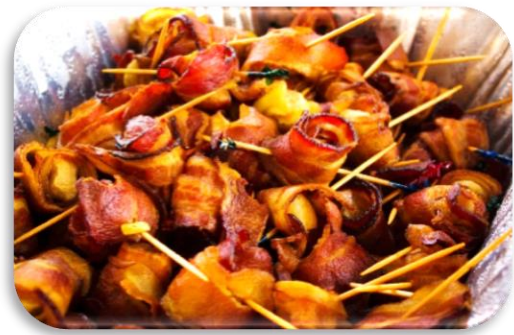
Bacon Wrapped Chestnuts

Traditional Crispy Bacon Wrapped Chestnuts. Served Warm.