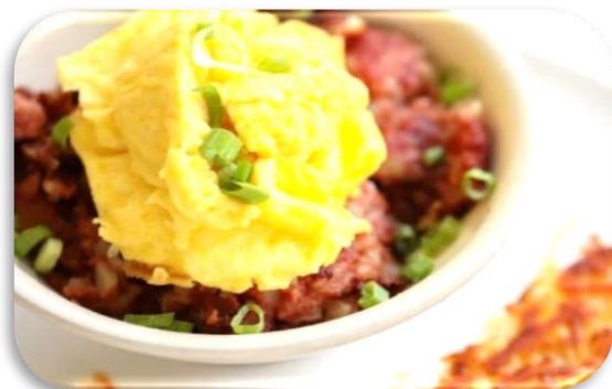
Corned Beef Casserole